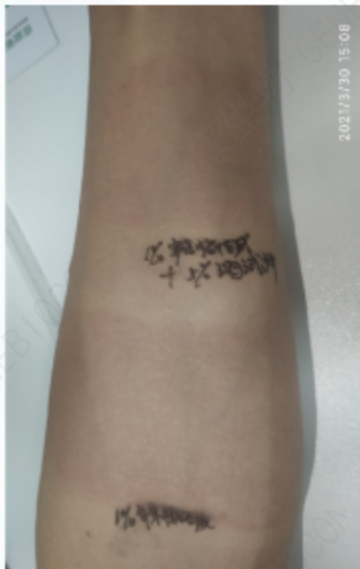
涂抹辣椒碱后为上图红肿现象 The red and swollen skin caused by capsaicin