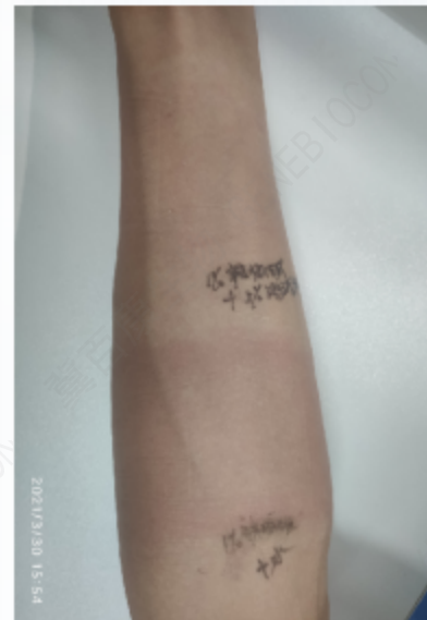
继续湿敷至20分钟后，皮肤红肿明显消退，红肿面积缩小 The red and swelling obviously subsided, the area shrink after other 20 minutes of wet packing.