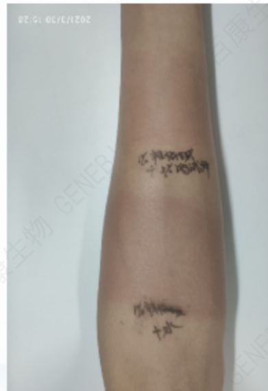
湿敷水和舒敏肌活肽溶液10分钟后，泛红逐渐消退 The red and swelling gradually reduced after 10 minutes of wet packing of Supanflami water solution.